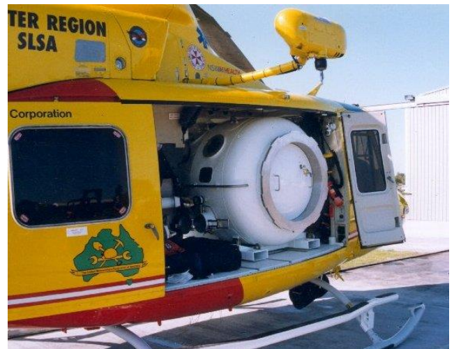
View Inside Transportable Recompression Chamber – TRC (left)

The system is capable of being transported to remote locations where diving operations or emergency rescue activities are to be carried out. The TRC can accommodate two persons (patient & attendant) and the TL, two persons. It is capable of diving to a depth of 70 meters. The TRC can provide oxygen, air, and mixed gases (or air & oxygen only) for an unlimited period (most dive tables are to a maximum of 6 hours). The TL provides air and oxygen.