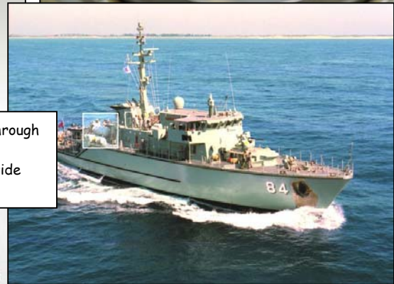
Top left to bottom: Chamber exterior - Chamber interior view through entry lock - Australian Navy Huon Class Minehunter with Cowan chamber - Cowan chamber on Thai Navy Minehunter Vessel - Inside main compartment.